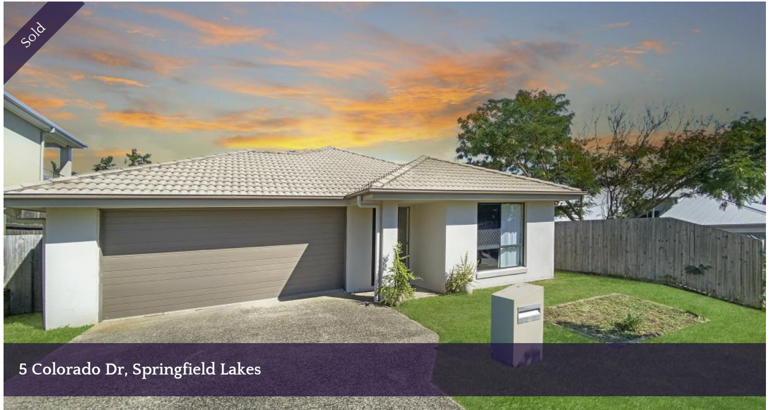
5 Colorado Dr, Springfield Lakes